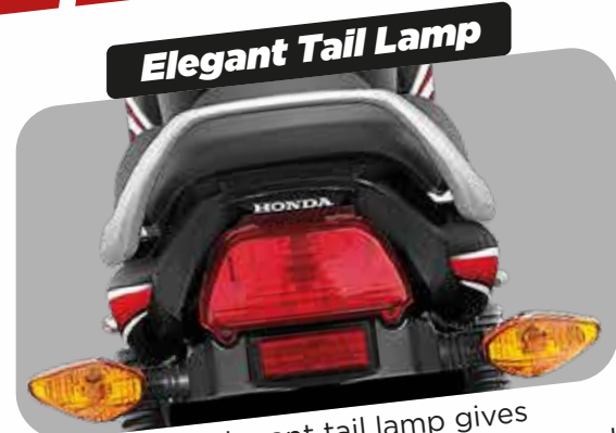
Elegant Tail Lamp Bright and elegant tail lamp gives the bike an imposing look from the back.